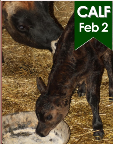
Anastasia gave birth to Goldie, a whopping 71 lbs. at birth. Both Jersey cows starred in NatGeo WILD's Fish Bowl II.

Coming soon: Pirate Fest, Saturday, May 2. Check out details at Lake Fairfax Pirate Fest website .